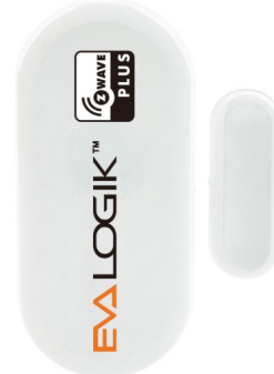
Door Window Sensor

Reorient or relocate the receiving antenna.Increase the separation between the equipment and receiver.Connect the equipment into an outlet on a circuit different from that to which the receiver is connected.Consult the dealer or an experienced radio/TV technician for help.This equipment should be installed and operated with minimum distance 20cm between the radiator and your body.