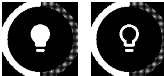
Light Control Screens in ON and OFF mode

Please note that the Light Level can also be controlled in OFF mode. The selected level will then become active when the Light is Switched ON.