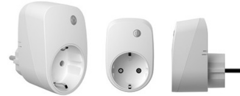
Germany type PAN38-1

Since the socket type for each country in Europe varies, refer to the outline for each socket suited for each country as follows: