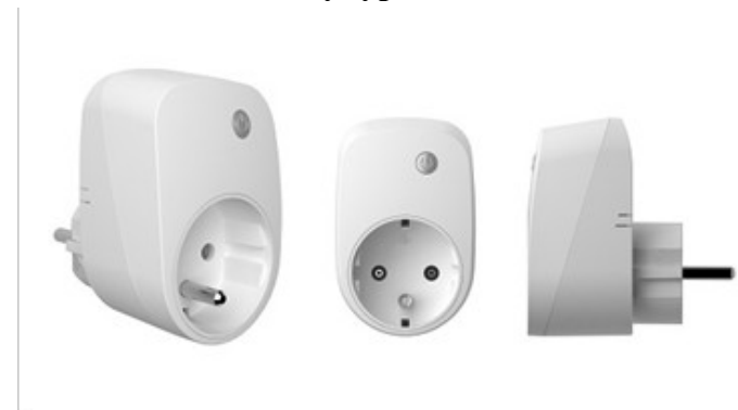
France type PAN38-2