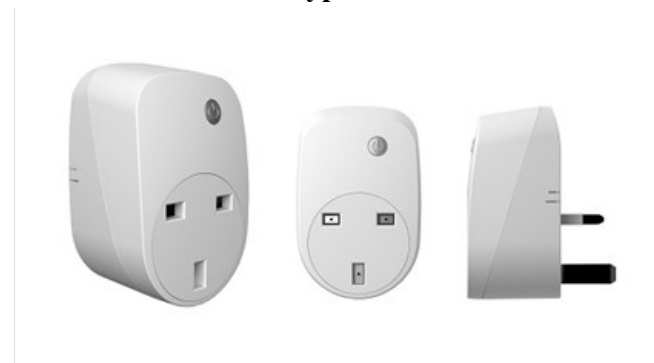
UK type PAN38-3