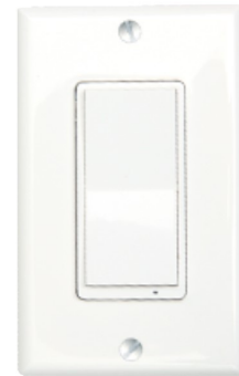
Smart ON/OFF Switch