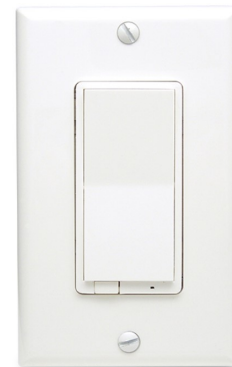
ZW313 Paddle Dimmer Switch