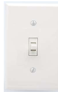
Smart On/Off Toggle Switch