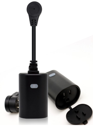
Outdoor Smart Plug

RISK OF FIRE RISK OF ELECTRICAL SHOCK RISK OF BURNS CONTROLLING APPLIANCES: EXERCISE EXTREME CAUTION WHEN USING Z-WAVE DEVICES TO CONTROL APPLIANCES. OPERATION OF THE Z-WAVE DEVICE MAY BE IN A DIFFERENT ROOM THAN THE CONTROLLED APPLIANCE, ALSO AN UNINTENTIONAL ACTIVATION MAY OCCUR IF THE WRONG BUTTON ON THE REMOTE IS PRESSED. Z-WAVE DEVICES MAY AUTOMATICALLY BE POWERED ON DUE TO TIMED EVENT PROGRAMMING. DEPENDING UPON THE APPLIANCE, THESE UNATTENDED OR UNINTENTIONAL OPERATIONS COULD POSSIBLY RESULT IN A HAZARDOUS CONDITION. FOR THESE REASONS, WE RECOMMEND DO NOT RETURN THIS PRODUCT TO THE STORE THE FOLLOWING: DO NOT USE Z-WAVE DEVICES TO CONTROL ELECTRIC HEATERS OR ANY OTHER APPLIANCES WHICH MAY PRESENT A HAZARDOUS CONDITION DUE TO UNATTENDED OR UNINTENTIONAL OR AUTOMATIC POWER ON CONTROL.