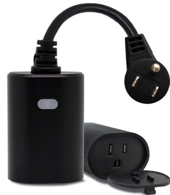
Z-Wave Outdoor Smart Plug