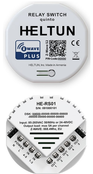
Figure 3: SmartStart QR Code & DSK

Note: The device QR code and DSK are printed on the front and rear of the HE-RS01 plus on the additional Security Card included in the packaging.