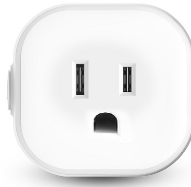
Mini Smart Plug