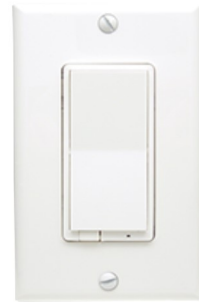
Smart Dimmer Switch

DO NOT USE Z-Wave DEVICES TO CONTROL ELECTRIC HEATERS OR ANY OTHER APPLIANCES WHICH MAY PRESENT A HAZARDOUS CONDITION DUE TO UNATTENDED OR UNINTENTIONAL OR AUTOMATIC POWER ON CONTROL.