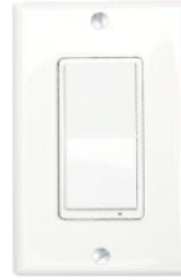
Smart On/Off Switch